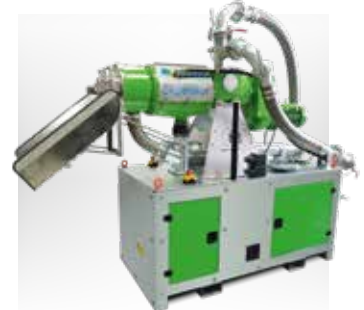
SEPARATOR PLUG&PLAY System for portable slurry separation