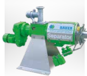
SEPARATOR Press screw separator for solid-liquid separation