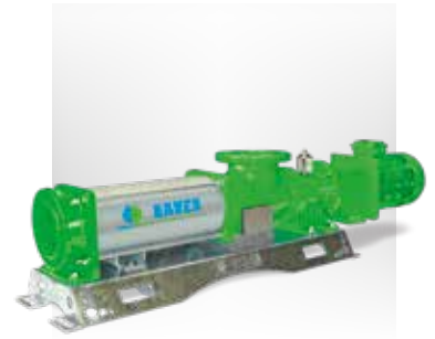
HELIX DRIVE Eccentric screw pump