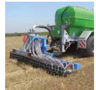
Slurry injector Innovative spreading technology