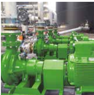
MAGNUM SX Thick matter pump gear and pedestal pump