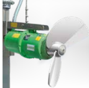
MSXH Submersible motor mixer