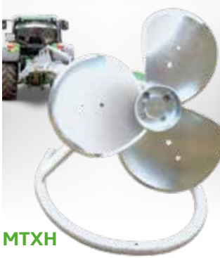
MTXH Tractor mixer