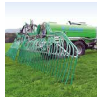
Trailing hose applicator Modular system for all types of tankers