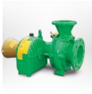
MAGNUM SM Thick matter pump gear unit design