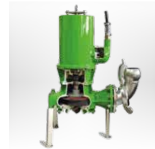
MAGNUM CSPH Submersible motor pump gear unit design